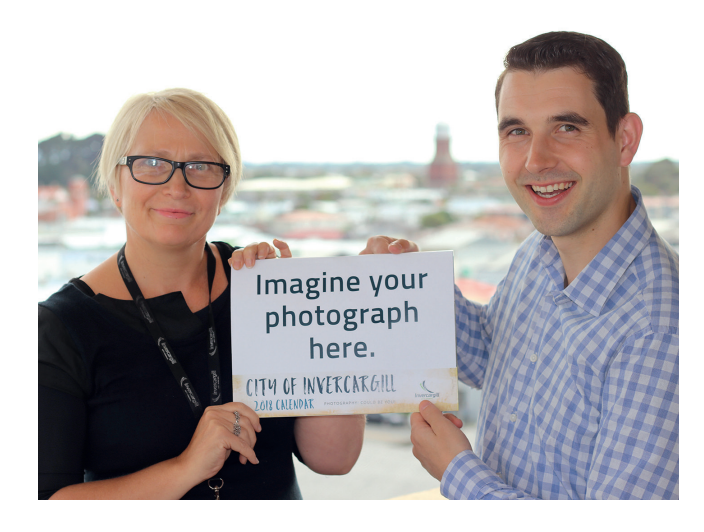
photo competition with an "Epic Invercargill" theme. The winning shots will be published in the 2018 ICC Calendar.

The competition will be split into three categories; Youth (under 18), Amateur and Professional. Four photos from each category will receive spots in the calendar, which is delivered to 30,000 Invercargill households annually.