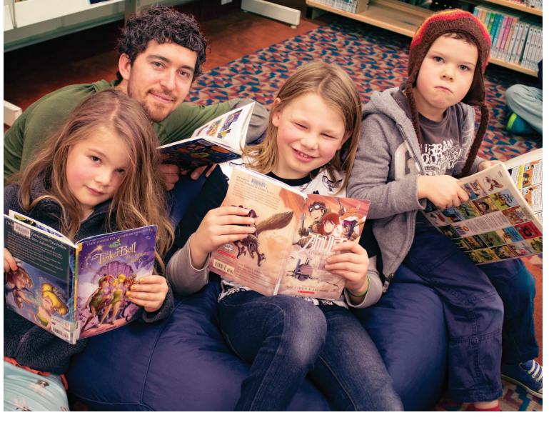
A family enjoys reading together at the Invercargill Public Library during the school holidays.

Reminder: The final date to pay registration without penalty is July 31. Dog owners can register their dog and pay at icc.govt.nz or in person at the Civic Administration Building, 101 Esk Street. Owners will then be supplied with the red registration tag for the 2017/2018 year. If owners fail to register their pets by 31 July, they will incur a 25 per cent penalty fee.