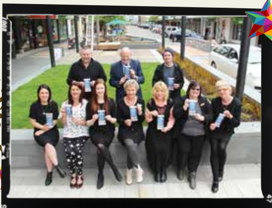
THE ESK STREET RETAILERS TEAM