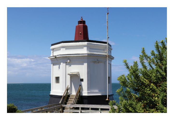
The Stirling Point Signal Station is set to be opened to the public

The Museum carried out extensive renovations to the storeroom so that the artefacts in storage are now kept in a dry environment. Dampness was a major problem in the storeroom and if the work was not done we could have potentially faced the prospect of damaged artefacts. Sliding shelving was donated by the Invercargill City Libraries and Archives making it easier to access all stored artefacts as well.