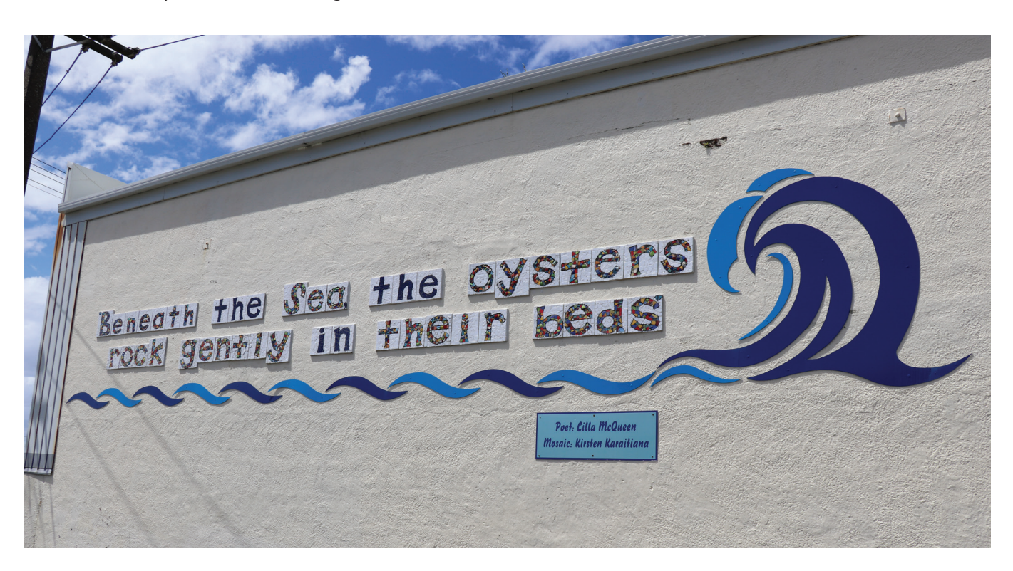
The Mosiac on the corner of Slaney and Gore Streets.

Bluff 2024's vision is to initiate projects and activities to enhance the appearance of our town with community support. The very small group of enthusiastic people have certainly achieved that to-date.