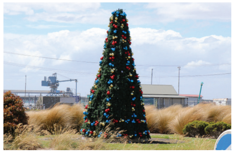
Bluff's Christmas tree set up on the main road.