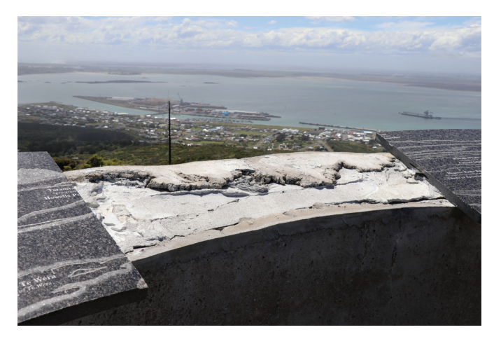
The vandalised Bluff Hill Panels.

Pedestrian access has been created to Argyle Beach beside the picnic table, which will make it easier for people to get down to the water's edge.