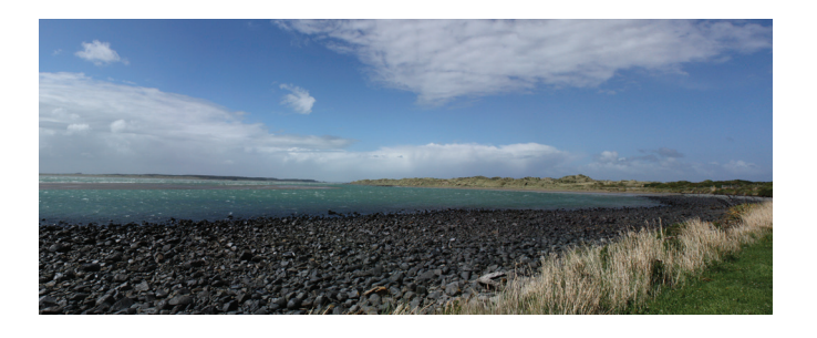
highlight that a potential resilience issue exists with access to the Omaui Township in the event that the road is forced to close.

The Omaui road was closed for one day to install a new culvert. Even though it was only closed for one day it did