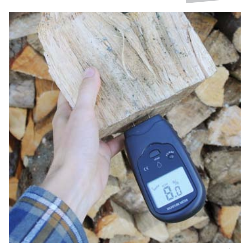
Burning wood which has less than 25% moisture content is more efficient and reduces the smoke from your chimney. A moisture meter can be a good way to check if your wood is ready to burn. Meters can be purchased for a relatively low cost or a limited number are available to borrow from the Invercargill Environment Centre.

▶ For more great tips on reducing the smoke your fire produces, visit the Breathe Easy Southland website.