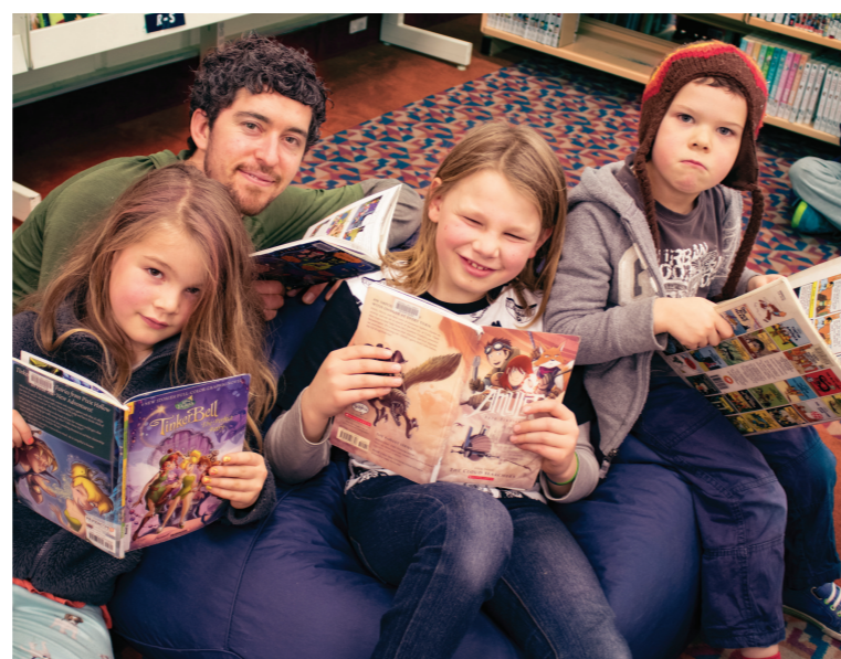
A family enjoys reading together at the Invercargill Public Library during the school holidays.

Reminder: The final date to pay registration without penalty is July 31. Dog owners can register their dog and pay at icc.govt.nz or in person at the Civic Administration Building, 101 Esk Street. Owners will then be supplied with the red registration tag for the 2017/2018 year. If owners fail to register their pets by 31 July, they will incur a 25 per cent penalty fee.