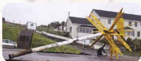
LEFT: The old sign had seen better days.