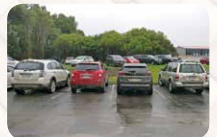
RIGHT: The existing Splash Palace carpark on Friday night.