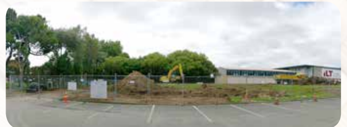
ABOVE: Work has begun on the extension to the Splash Palace carpark.

Carparking at Splash Palace has always been a bit challenging, especially during busy times (just ask anyone who has tried to get a park during Friday afternoon Waterpolo!). So we're extremely pleased to report that work has also begun on the extension to the Splash Palace carpark. This is likely to be completed by Christmas and the