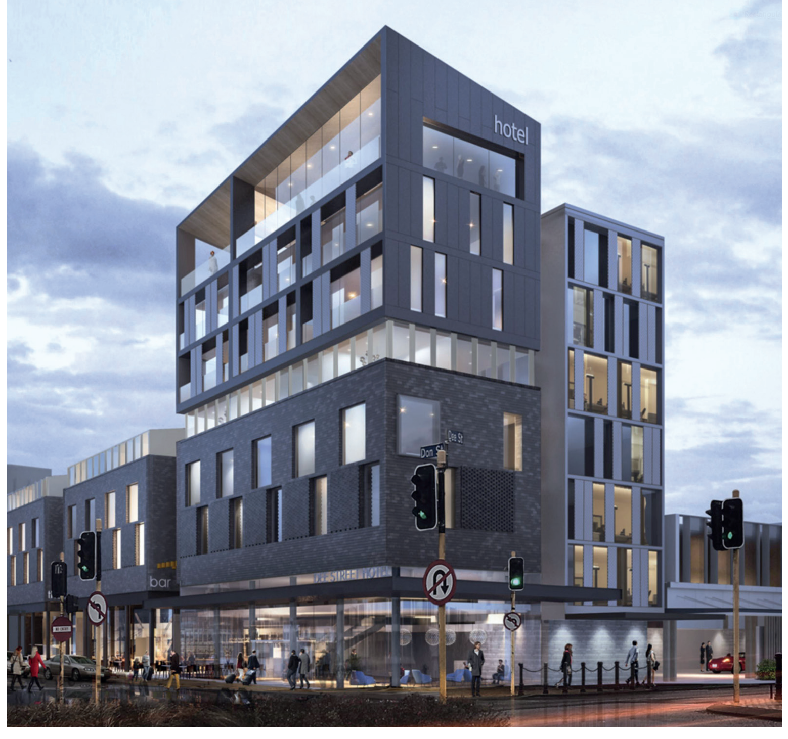
ABOVE: Architectural interpretation of finished ILT Hotel on the corner of Dee and Don streets.

LEFT : The former Caledonian/ Langford building is to be demolished.