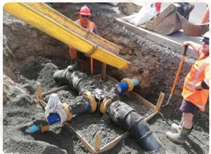
ABOVE: SouthRoads contractors with a new water main connection in Dee Street.

For regular updates on the project, visit www.icc.govt.nz or www.facebook.com/invercargillwordonthestreet