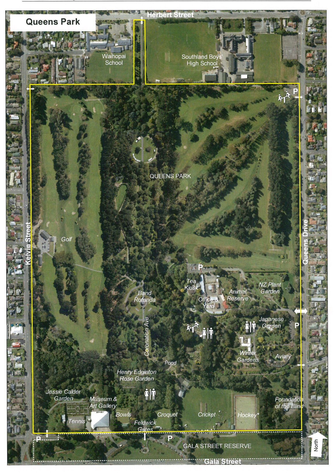
Invercargill City Council Parks Division