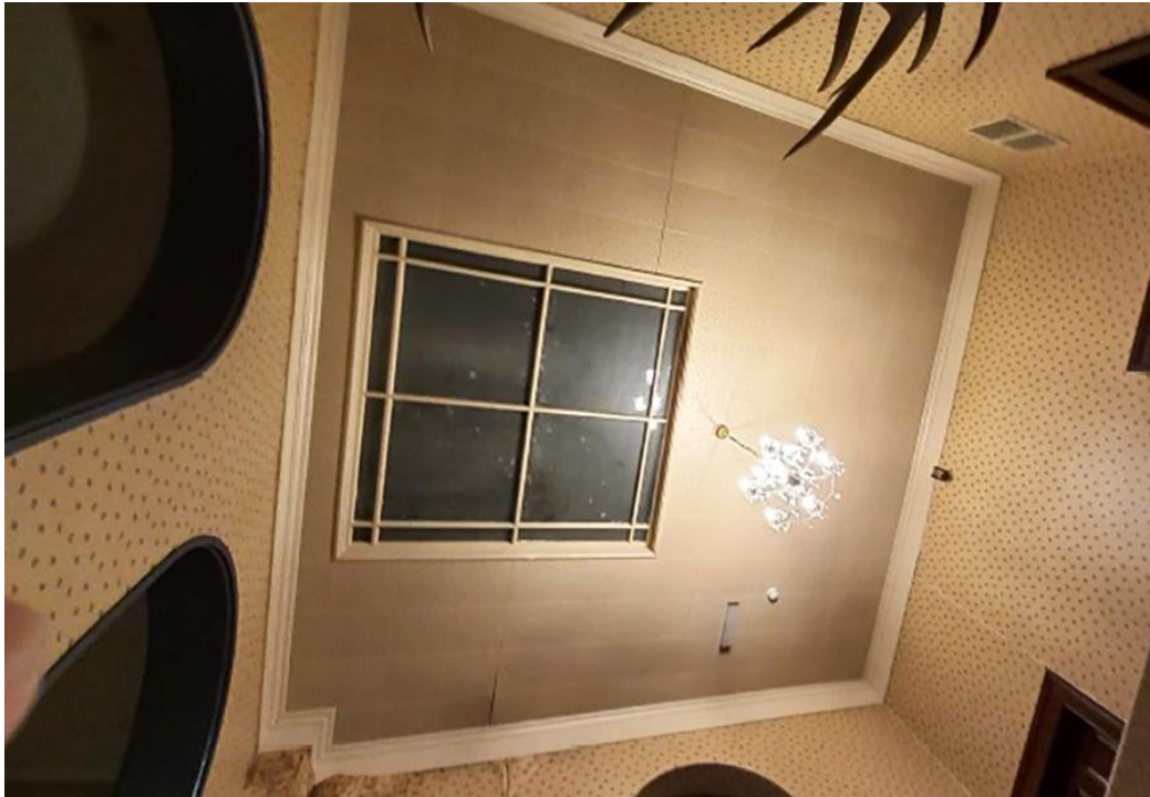
Figure 2 – First storey stairwell ceiling during refurbishment